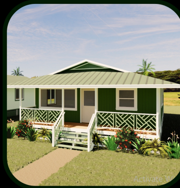
Kauhale O Namahana Co-developed* 11 Units Kīlauea, Kaua'i