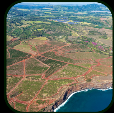
Kauhale O Kalaheo Co-developed** 17 Units Kalaheo, Kaua'i