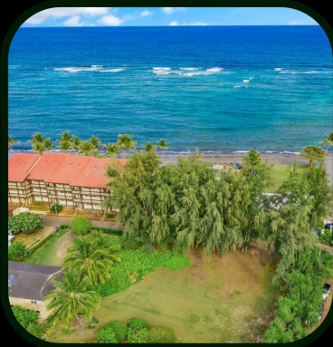
Kauhale O Waipouli Co-developed* 17 Units Kapa'a, Kaua'i

These projects will provide for sale & leasehold homes for low- to middle-income households at 120% AMI or below, giving priority and preference to those who live or work in the area.